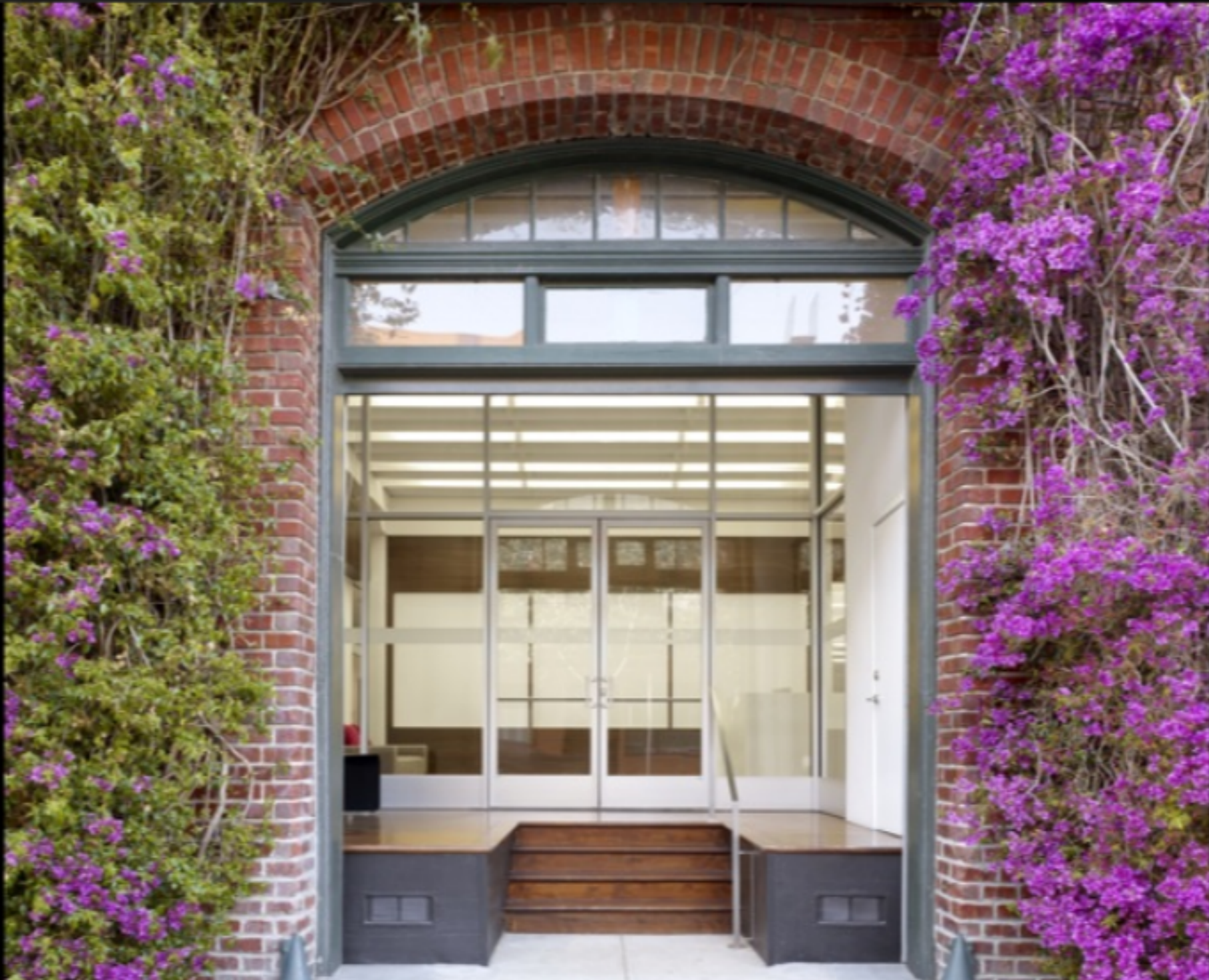
The former loading bay in this warehouse-turned office forms the main entry.