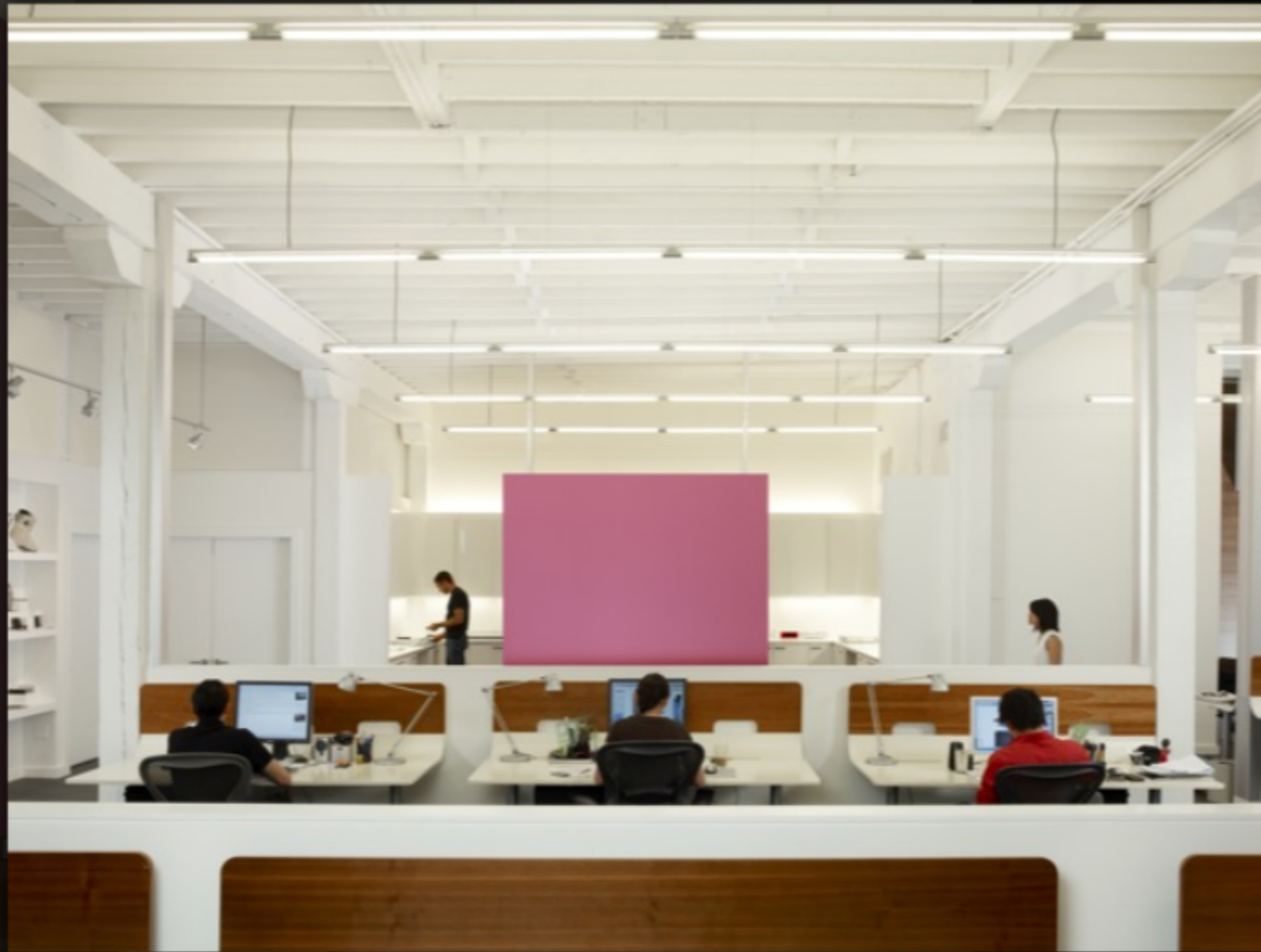
Accents of hot pink enliven the interior.